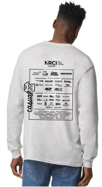
Back of shirt

Ash Grey t-shirt has CASUAL Day logo on front and sponsors on the back.