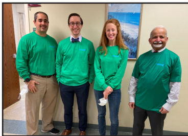
Northeast Radiation Oncology Centers (NROC)

Here are a few teams in their 2022 Kelly Green C.A.S.U.A.L. Day shirts: