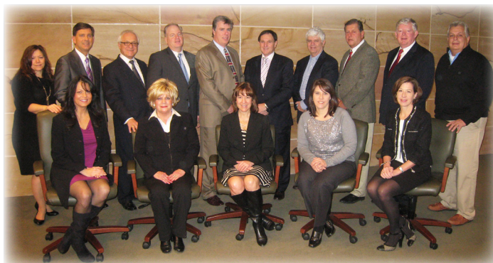
The Northeast Regional Cancer Institute Board of Ambassadors raised more than $45,000 at the Spirit of Hope Celebration

The Cancer Institute is grateful to the Board of Ambassadors for their support and to all the community organizations and individuals who helped make the second annual Spirit of Hope Celebration a success.