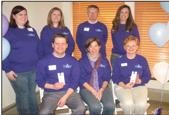
C.A.S.U.A.L. Day committee members gather to finalize plans for this year's event on Thursday, March 25th.

On March 25th dress C.A.S.U.A.L., as determined by your workplace, and spread the word about colorectal cancer prevention and screening.