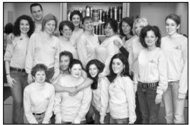
Sanderson Place on State Street in Clarks Summit supports C.A.S.U.A.L. Day