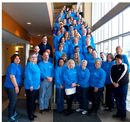
C.A.S.U.A.L. Day Participants at Misericordia University in Luzerne County

The Cancer Institute would like to extend a sincere thank you to the thousands of individuals and organizations who took part in the 11th annual C.A.S.U.A.L. (Colon cancer Awareness Saves Unlimited Adult Lives) Day on March 27, 2014.