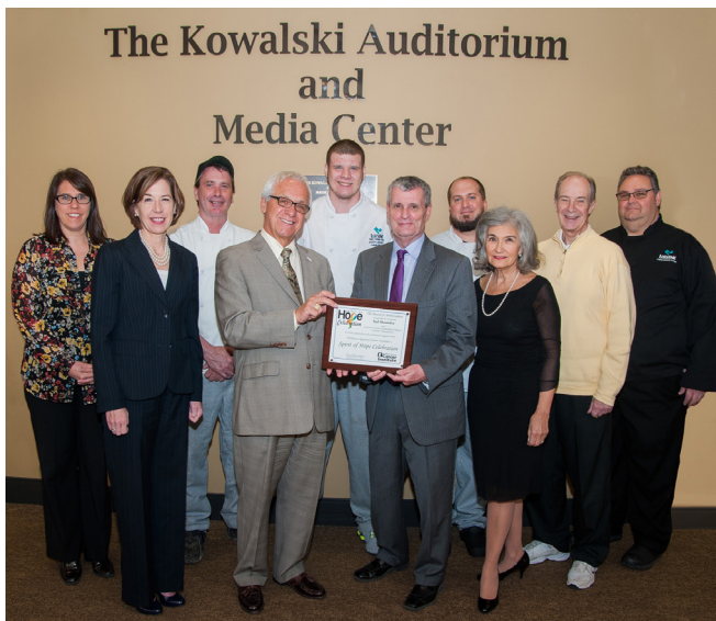
Ambassadors Recognize Luzerne County Community College's contribution to the annual Spirit of Hope Celebration