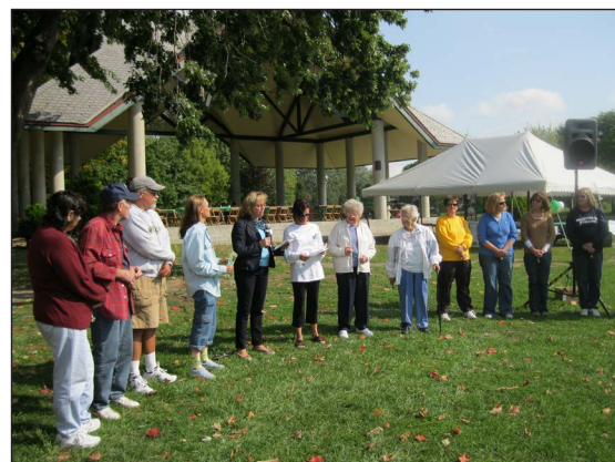
Cancer survivors, caregivers, and healthcare professionals participate in the "Circle of Survivors" during the 2012 Cancer Survivors Celebration at Kirby Park in Wilkes-Barre.

To register for the event, or for more information, please call the Northeast Regional Cancer Institute at 1-800-424-6724 or visit www.cancernepa.org . Please respond prior to September 13th.