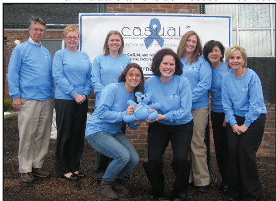
C.A.S.U.A.L. Day committee members model the 2011 shirt design.

Individuals and businesses interested in participating in C.A.S.U.A.L. Day can do so by selecting someone to serve as a team captain. Team captains will be in charge of ordering and distributing this year's Carolina blue C.A.S.U.A.L. t-shirts for $15, and pins, for $5.