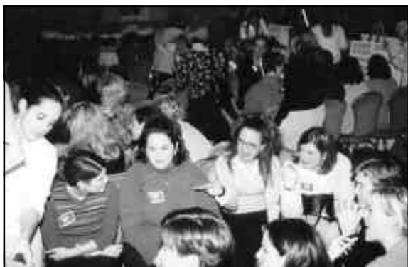
Members of the Greater Scranton Chamber of Commerce's team enjoy the festivities.

Many attendees were return visitors from the previous year's event, who had so much fun they came back and brought with them more friends and colleagues. And there were also many new faces, as well. Whether old or new, the Cancer Institute welcomed all of its friends, and looks forward to next year's fun!