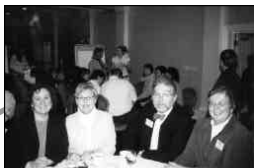
Cancer Institute staff members take time out to relax at the event.