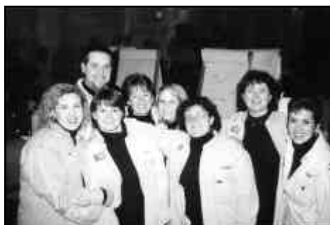
The award-winning team from DGK Insurance showed their team spirit.