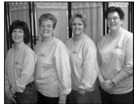
The Women's Imaging Center