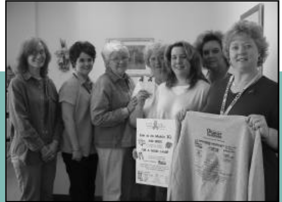
Hospice Preferred Choice