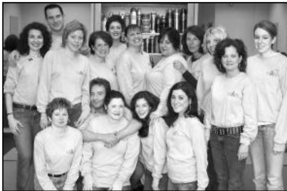
Sanderson Place on State Street in Clarks Summit supports C.A.S.U.A.L. Day